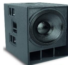
Image Shown Without Grill